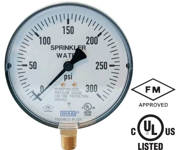
Bourdon Tube Pressure Gauge Type 111.10SP